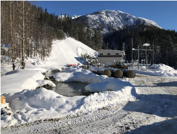
Photo 10 – Seepage from the BDRHEF tunnel continues to infiltrate to ground within the infiltration ponds (January 12, 2017).