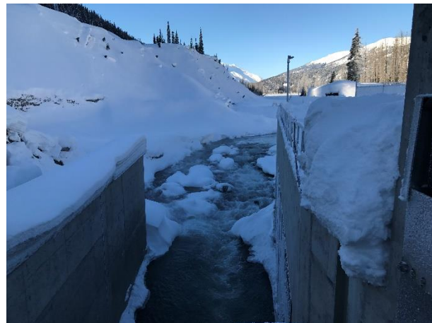
Photo 6 – All river flows continued pass through the sluice gate during the reporting period (January 12, 2017).