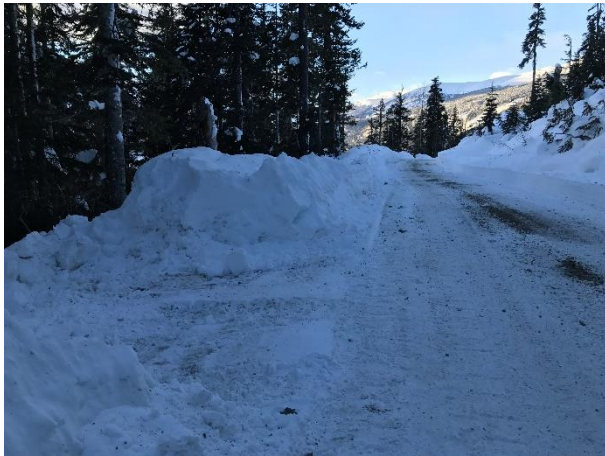
Photo 1 – Gaps in snow plowing sufficiently spaced through the mountain goat migration corridor (January 3, 2017).