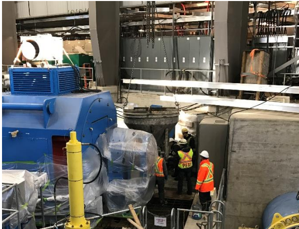
Photo 7 – Concrete pour within the ULRHEF Powerhouse (January 12, 2017).