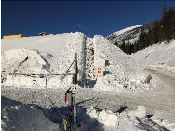
Photo 3 – Workers remove snow from the electric fence as soon as possible following storm events (January 3, 2017).