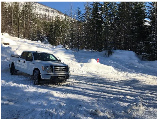
Photo 9 – Conditions at the entrance of the BDRHEF intake access road. No plowing has occurred (January 12, 2017).