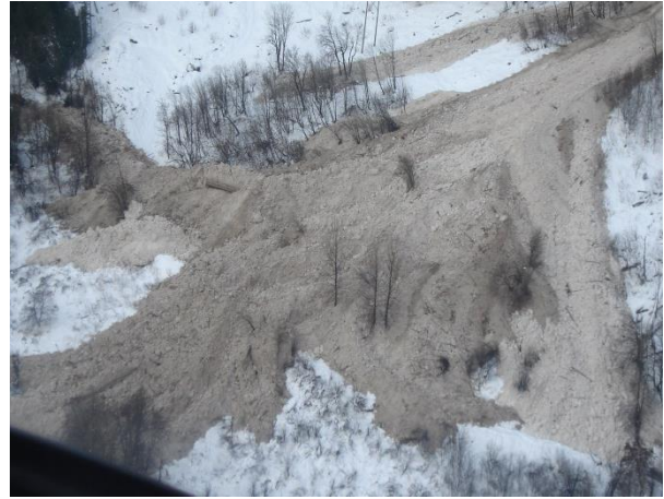
Photo 4 – Large avalanche and debris flow blocking Lillooet River FSR following avalanche at KM26.5 (January 20, 2017)