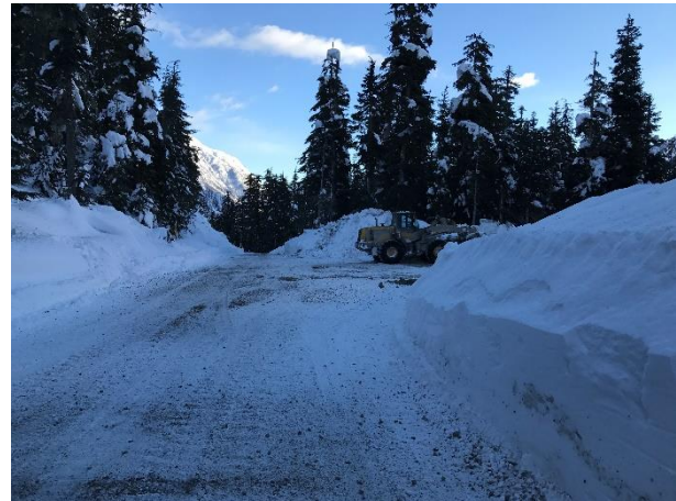
Photo 2 – Snow removal activities at KM46.5 on the Lillooet River FSR (January 3, 2017).