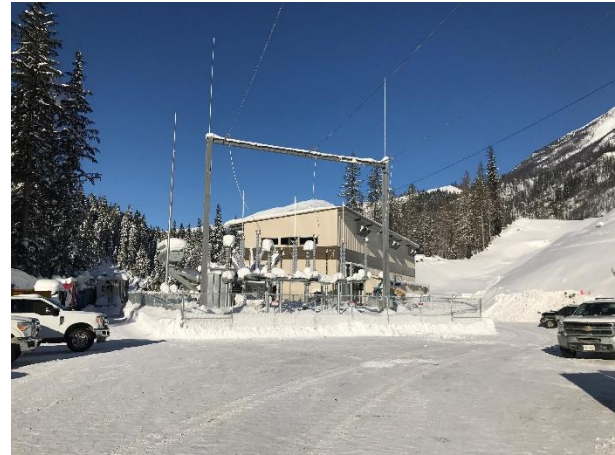
Photo 8 – Conditions of the switchyard at powerhouse area (January 12, 2017).