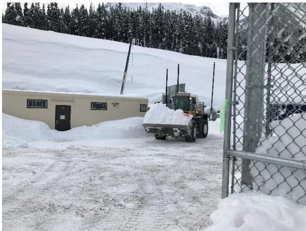
Photo 5 – Continued snow removal at the ULRHEF intake to facilitate dry commissioning (January 25, 2017)