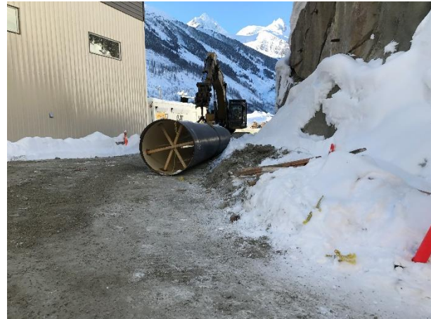
Photo 11 – Steel Liner installation works at the BDRHEF tunnel portal (January 12, 2017).