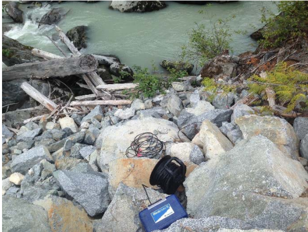
Photo 1 – Hydrophone and seismograph installed to monitor instream acoustic pressure during the blast at future pole 258 location (July 22, 2015).