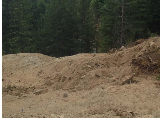
Photo 2 – Site condition at future pole 258 location post blast. (July 22, 2015)