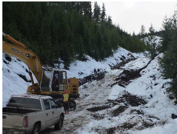
Photo 2. Ditching and cross ditching installed along completed section of road alignment on the east heading of Truckwash Creek. Work was completed as part of winterization of the site. (Nov 8, 2013).