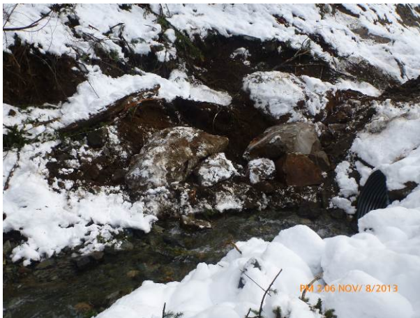
Photo 1. Culvert inlet armouring being installed in the dry above the waterline at the 1600mm culvert, following hand removal of woody debris from around the culvert inlet. The IEM was onsite to monitor this work and no WQ concerns were noted (Nov 8, 2013).