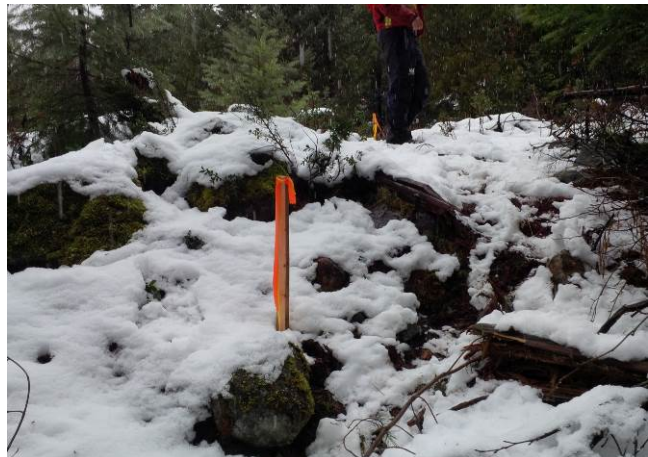
Photo 4. Seismic survey alignment at the BDRHEF powerhouse area. The IEM conducted a precautionary Coastal Tailed Frog salvage prior to the start of work within 100m of Boulder Creek (Nov 9, 2013).