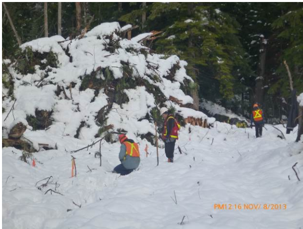
Photo 3. Seismic survey work being conducted in the presence of the archeology monitor at the ULRHEF powerhouse area (Nov 8, 2013).