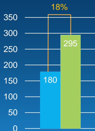
ADJUSTED EBITDA ($M)